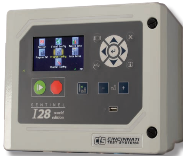
Sentinel I28 Multi-functional leak test instrument