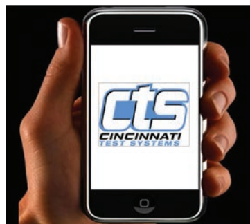
Send text message via email alerts